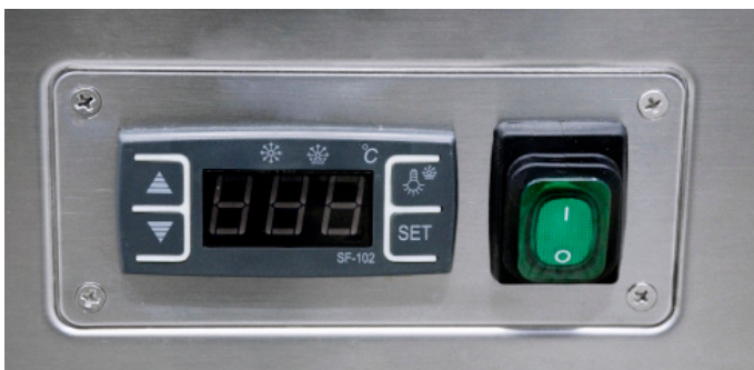
Digital temperature controller & display